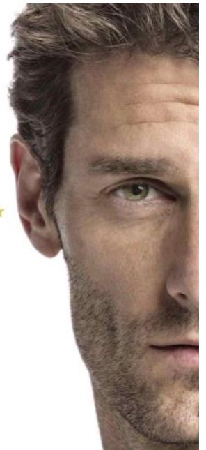
Mark Webber Aussie Grit