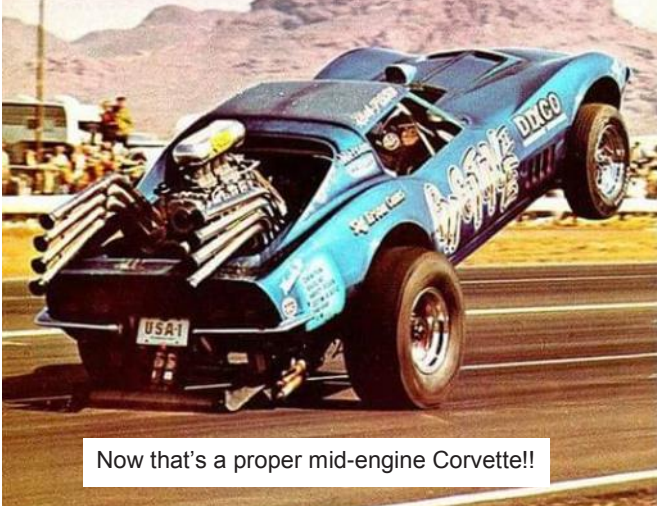
Now that's a proper mid-engine Corvette!!