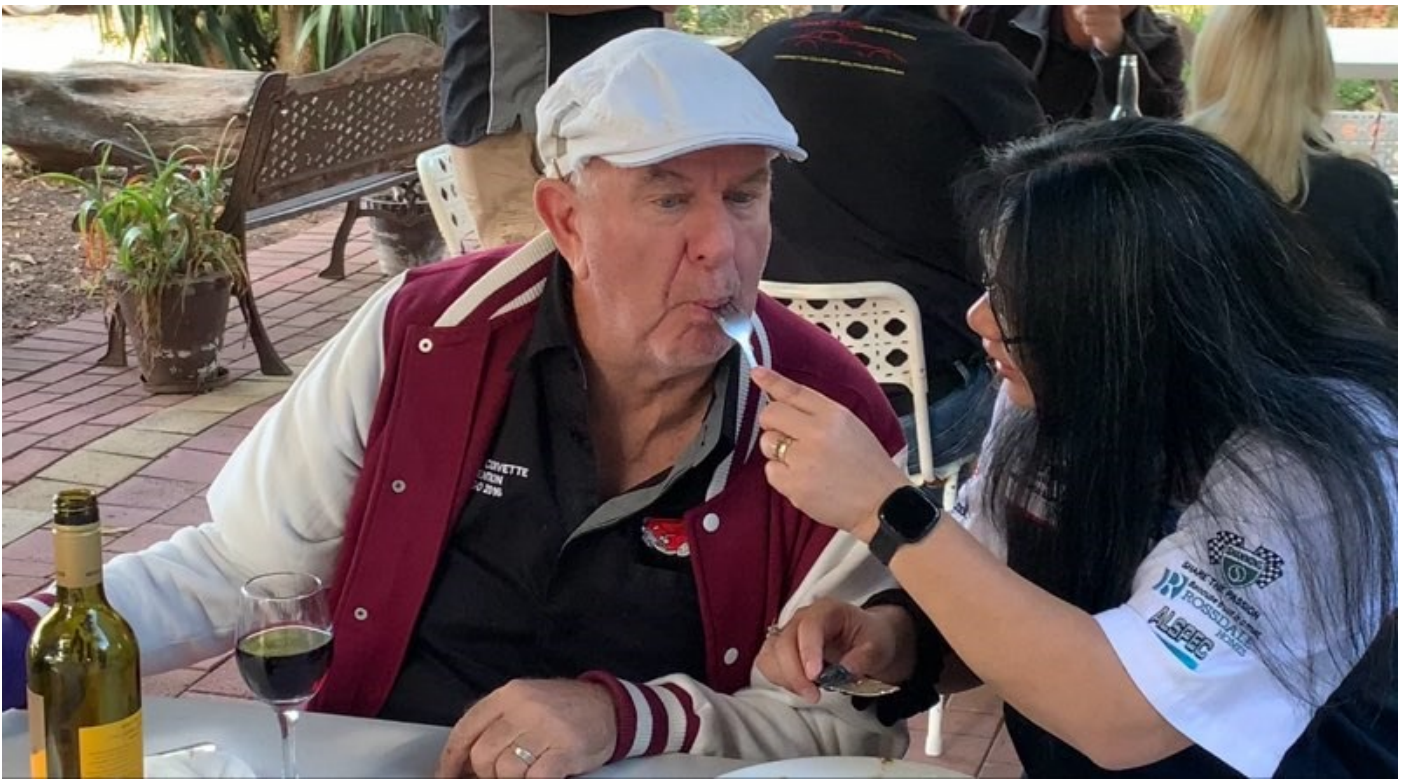
"CHOO CHOO CHOO, OPEN WIDE"