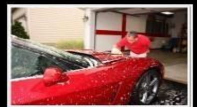
What I actually do.