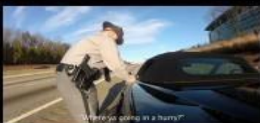
What Insurance Companies think I do