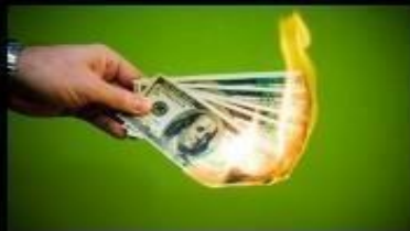
What my family thinks I do.