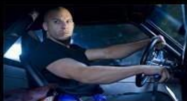
What I think I do.