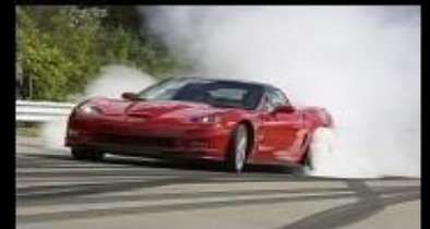
What society thinks I do.