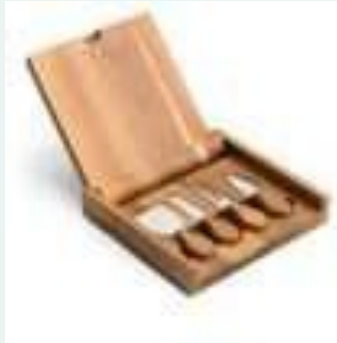
Clamshell Cheese Board Acacia Wood $50