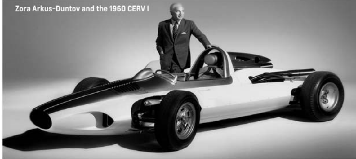
Zora Arkus-Duntov and the 1960 CERV I