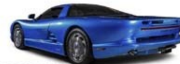
1990 CERV III