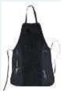
Master Grill Music Apron Black/Charcoal $40