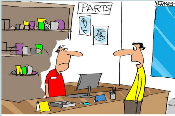
"I'm restoring a '72 vette, but i'm not mechanically inclined. I heard I'll need some tools, so I'll probably need a spanner or two and give me one of them screwdriver things"