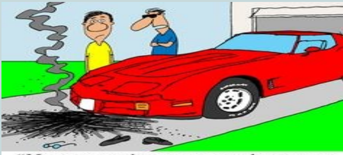
"My new security system vaporizes anyone who gets too close to my Corvette. I'm going to miss Jim."