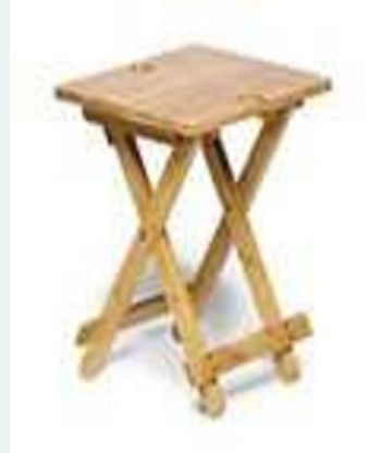
Tavolo Table Bamboo $65