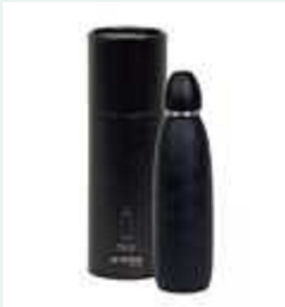
Bullet Vacuum Flask St/Stl $35