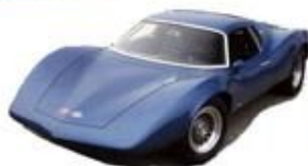
1968 ASTRO II