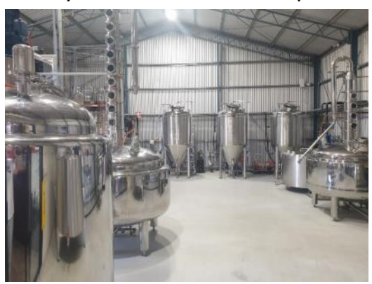
Then we will drive to Coopers Ale House at Wallaroo for lunch at 1:30