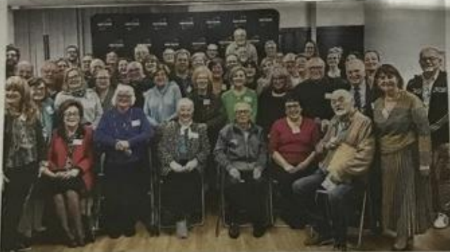
Foto di gruppo durante l'evento dedicato al volontari di Radio Italiana 531

"Grazie a tutti per esservi uniti a noi questa sera. [...] Anche se questa è la settimana in cui