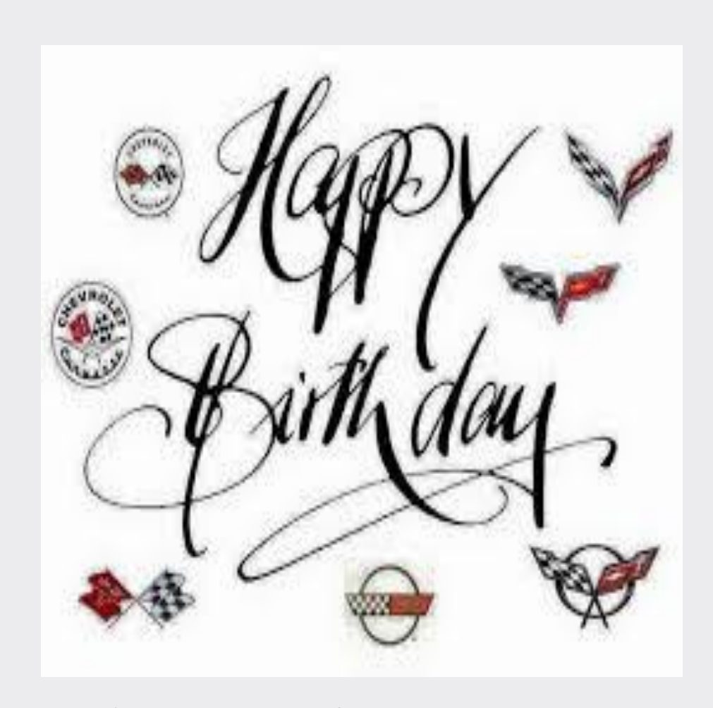
Apologies If you have been missed. Club records may not have your Birthday