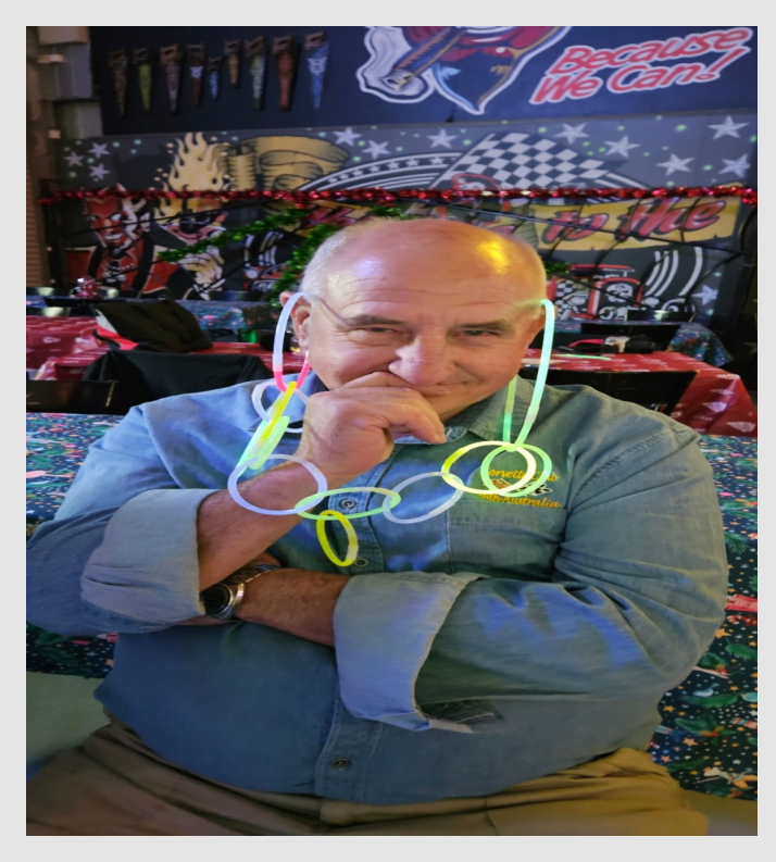
Hi All I hope that everyone had a relaxing Christmas and New Year.

We have quite a few things to sort out as our AGM approaches in March , if anyone wants to stand for a committee position, all positions will be declared vacant at the AGM and nomination forms will be available at each meeting until the AGM where a committee will be selected.