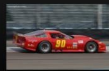
what I think I drive