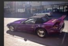
what men think I drive