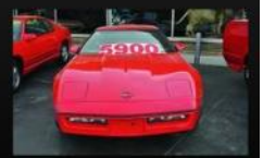
what I really drive