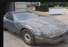
what other Corvette owners think I drive