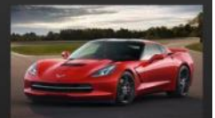
what kids think I drive