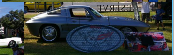
Article By P.McBride.