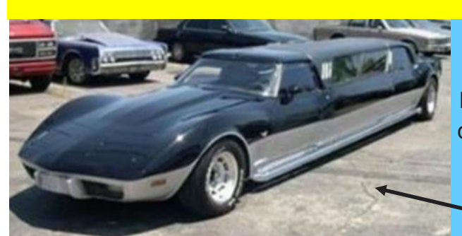
So, word on the Grapevine says Rudi and Kay are doing some mods to their C3.....????

prox. 5 years during which time we have added 18" Z06 chrome wheels, window tint, new leather bound steering wheel and a number of upgrading parts. Unfortunately, due to III health, it is now sitting idle in garage, with approx. 110,000 kms on clock. We would love it to have a new home. Ph: 0417849449 or email jenjeffw@gmail.com.