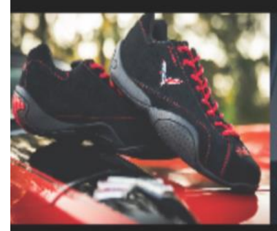
Based on the Prototipo Style. A Based on the Spyder Style. A distinctive black and red colour distinctive black and yellow colour scheme, official C7 crossed flags scheme, official Corvette® Racing badging and race-inspired stitching are among the design features.